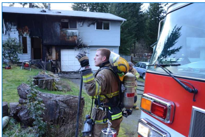
A firefighter pauses after work to keep the fire from destroying the home.

http://www.cdc.gov/mmwr/preview/mmwrhtml/mm60e1004a1.htm?s_cid=mm60e1004a1_e&source=govdelivery